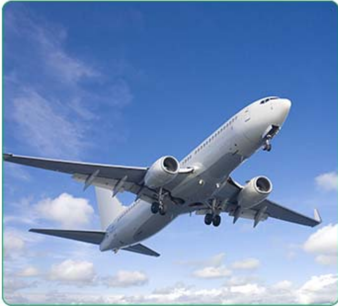
Transportation GHG emissions per ton-kilometre of product shipped